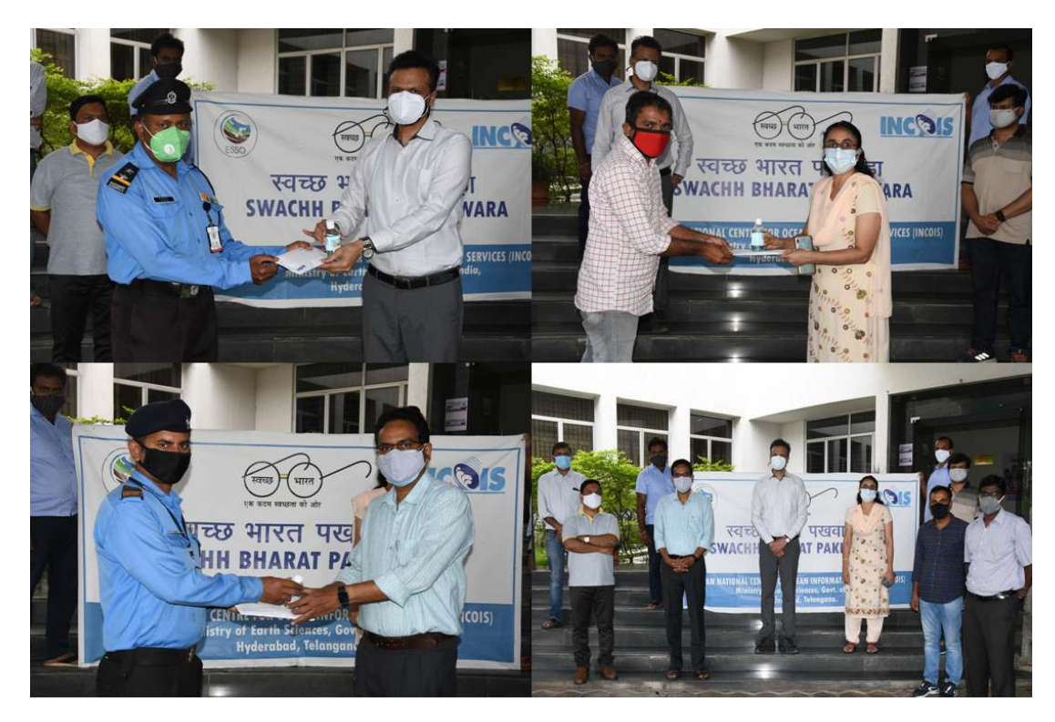
Photo-2: Distribution of COVID essential kits to Housekeeping staff and Security Personnel