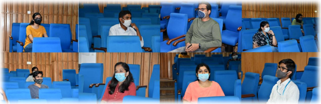
INCOIS colleagues attending webinar on large screen at auditorium