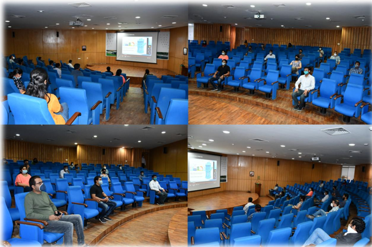
INCOIS arranged for screening the webinar at auditorium while maintaining COVID-19 related precautions