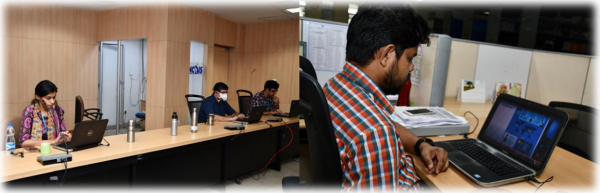
(L) INCOIS team coordinating webinar hosting with speaker on extreme right end (R) An INCOIS employee intently attending the webinar from own work-desk

The webinar was a major success with about 130 attendees, in addition to the INCOIS employees who attended from their work desks or from INCOIS auditorium. All the necessary precautions were taken as per prevailing guidelines while screening the webinar in the auditorium.