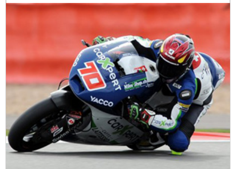
Britain Moto GP