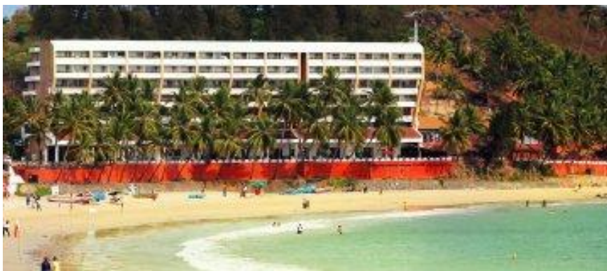
Figure 2: Bogmalo Beach Resort, Bogmalo