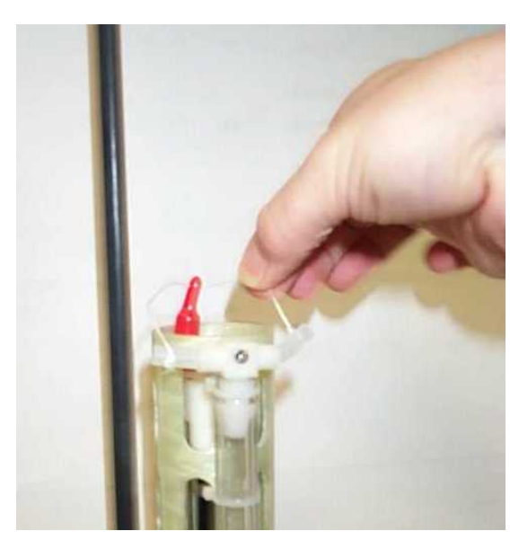
IMPORTANT: Remove plastic bag and three plugs from CTD sensor , if they have not already been removed.